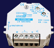
Time Relay (for Key Card Switch)