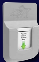
Venergy Key Card Switch